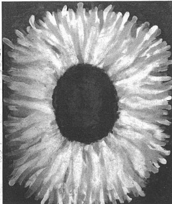
Clockwise starting from far left: The painting "Flowing River" demonstrates Mendoza's interpretation of nature. The artist's painting "Daisy Dreamer." The painting "Wise Tree" which inspired Mendoza's best-selling cotton fabric collection. To see more photos visit www.roundupnews.com/a-e or www.georgemendoza.com .