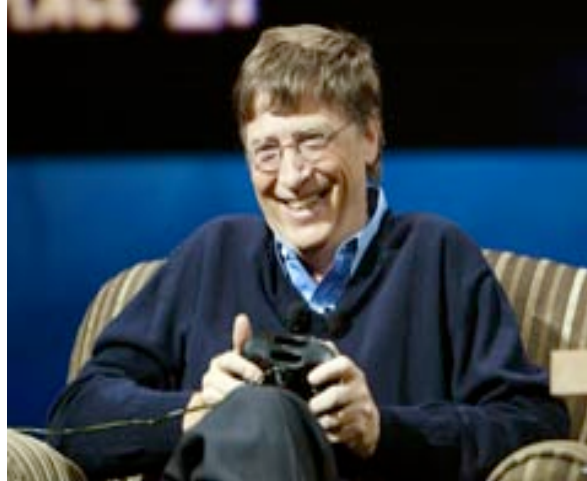
Printed with permission of Microsoft