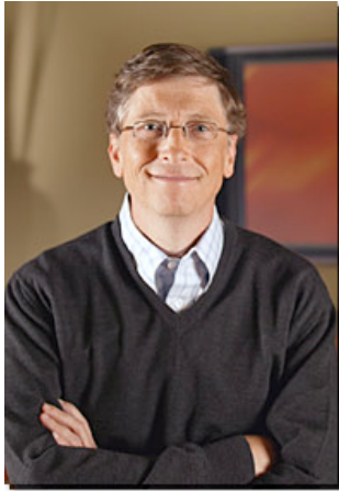
Printed with permission of Microsoft