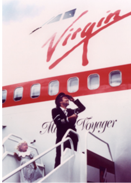
Printed with permission of the Virgin Group