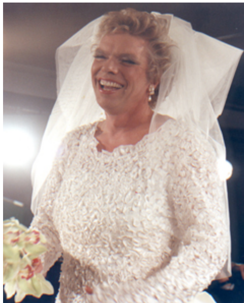
Printed with Permission of Virgin Group