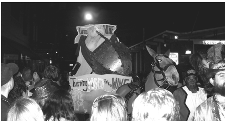
Figure 9. The Mystic Krewe of Spermes float during the Krewe de Vieux parade

they eventually dissipate into smaller clusters over the course of the next several hours. The on-parade trespass typically lasts between 30 seconds and 20 minutes — during the current study, MKS marched for approximately 5 minutes before being expelled.