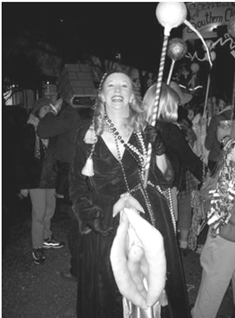
Figure 6. Exaggerated female genitalia

following discourse from the selection process of the king of the parade demonstrates the unofficial and highly sacrilegious aspect of this process: