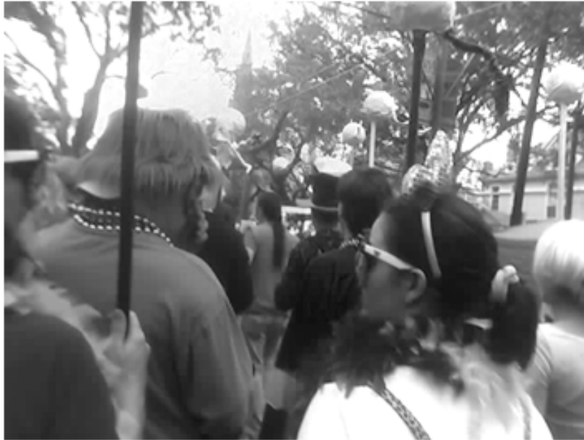
Figure 5. Spermes chase 'The Egg' toward the French Quarter on Mardis Gras day.

Such ritual degradation should not be seen as aiming to destroy political forms, but rather to bring these forms down to earth, captivating them at the level of local material culture. In this sense, sexuality in carnivalesque forms is semiotically opposed to formalized sexuality in spectacular events. For example, Barthes (1970) described the sexuality of striptease as antisexual and distancing, and the notion of the 'objectifying' nature of sexual exposure has an elaborate history in the academic literature (e.g. De Beauvoir 1952; Fredrickson and Roberts 1997). This use of the body in an objectifying way seems well embodied in mainstream Mardi Gras parades, where the 'King and Queen' of the krewes stand on tall platforms, intricately adorned and masked (Kinser 1990). The opposite is the case with KdV, whose 'subjectification' of the body emphasizes the exposure and celebration of bodies of all shapes and sizes, adding caricatured bodily enhancements, and turning on its head the traditional norms of physical beauty (see Figure 6).