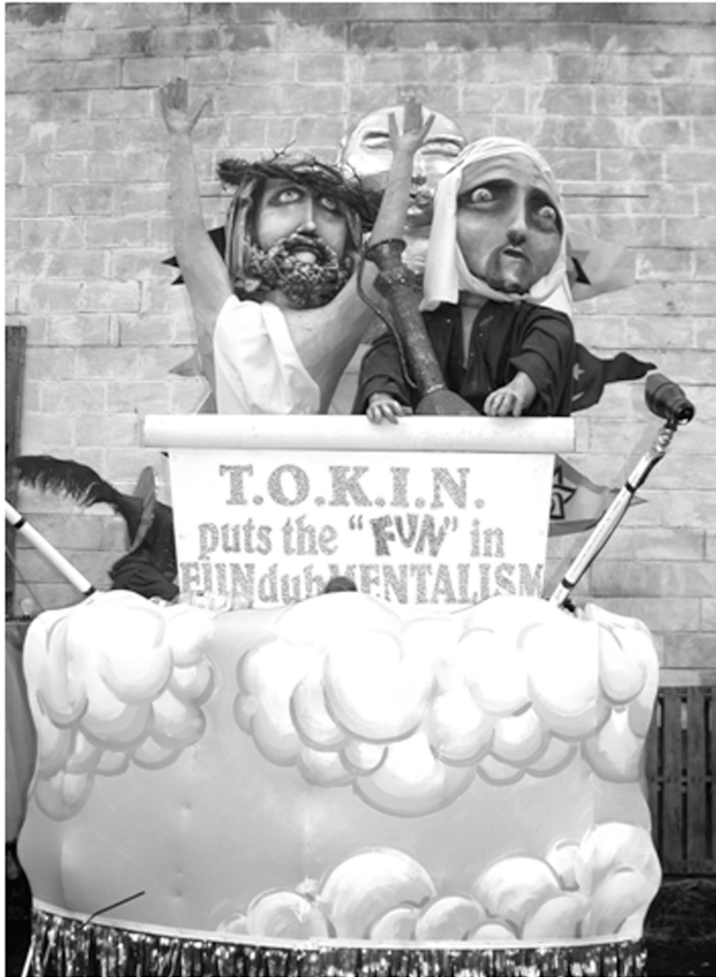
Figure 2. A float of the Krewe of T.O.K.I.N. showing a Christ figure and disciples smoking cannabis; inscription reads 'T.O.K.I.N. puts the 'FUN' in FUNduhMENTALISM'

Given the nature of the organizational data described above, one may ask if our own article is too controversial, dealing with body parts and fluids and grotesque humor. In defense of our presentation of taboo, we note that several key works in the academic cannon have emphasized taking on the very frames of reference implicit in the subjects involved, thus using narrative to participate in the traditions under study. This is apparent in such classic works as Geertz's (1973) 'penetrating' exploration of the Balinese Cockfight as 'deep play', and De Andrade's (1970) 'Anthropophagy Manifesto'. Thus, some degree of grotesqueness is called for so as not to betray one's subject matter under the guise of academic style.