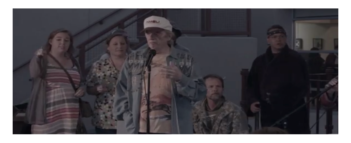
Rehearsal at Ice Cream Parlor, Open Mic, to raise money to pay for theater time on NMSU campus.<sup>20</sup>