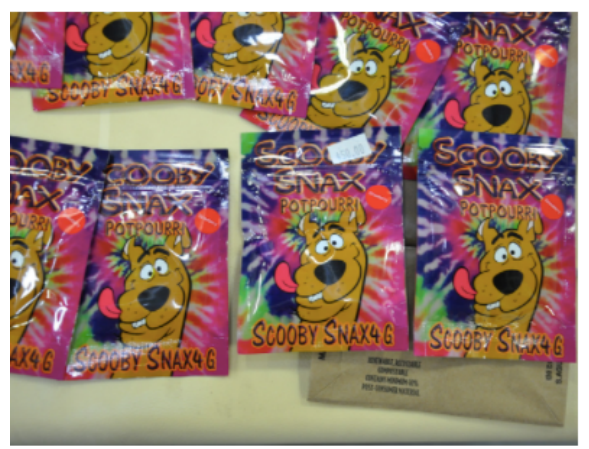
Packets advertising Scooby Snax contain the drug spice.

Spice is sold to middle school children under the name, Scooby Snax. Spice (or K2, Scubby Do, Afghan Ice, and so on), dates to 1984. "Spice is sold as "incense" or "potpourri" in local head shops, gas stations, and on the Internet, often escaping regulation due to labeling that markets the plant-based material sprayed with synthetic drugs as "not intended for human consumption." Synthetic cathinones, called "bath salts," are hallucinogenic drugs